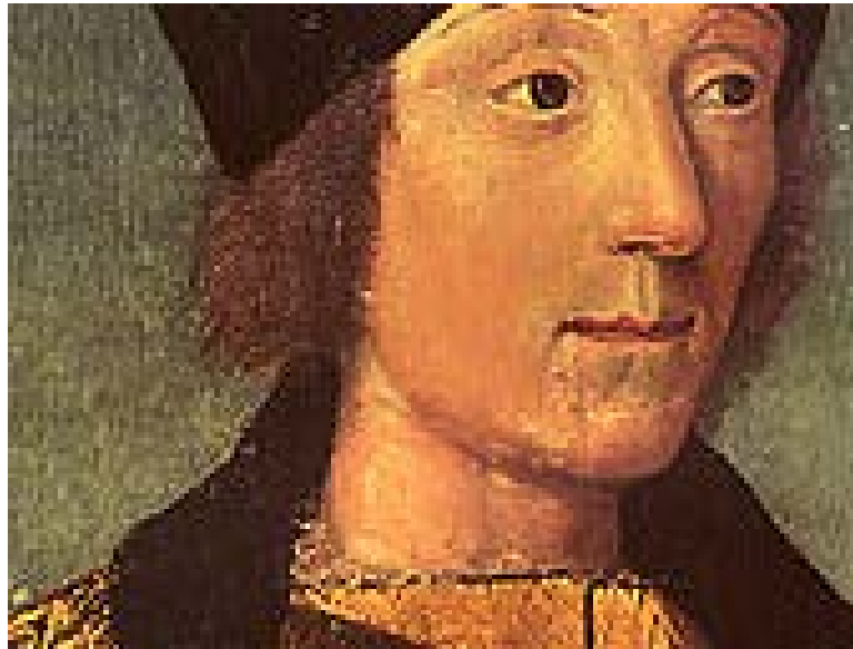
Harry Tutor – Henry VII